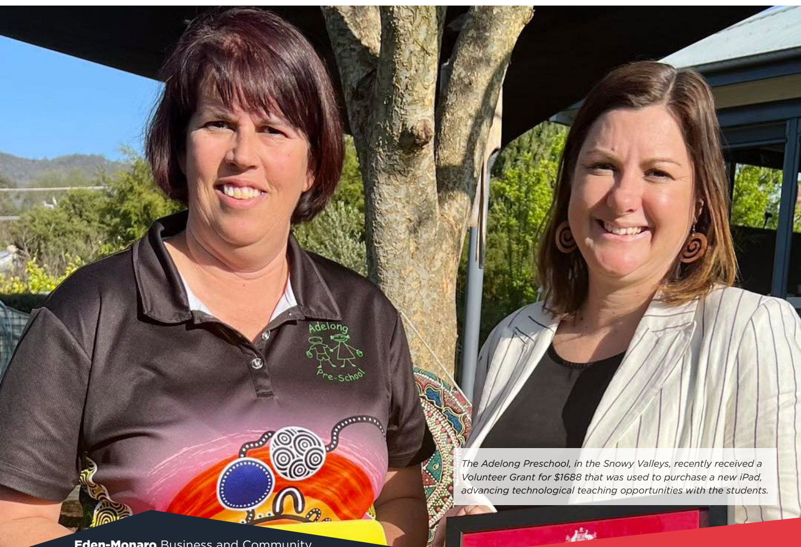
The Adelong Preschool, in the Snowy Valleys, recently received a Volunteer Grant for $1688 that was used to purchase a new iPad, advancing technological teaching opportunities with the students.

① https://education.nsw.gov.au/skills-nsw/aboriginal-and-torres-strait-islander-peoples/elsa-dixon-aboriginal-employment-grant