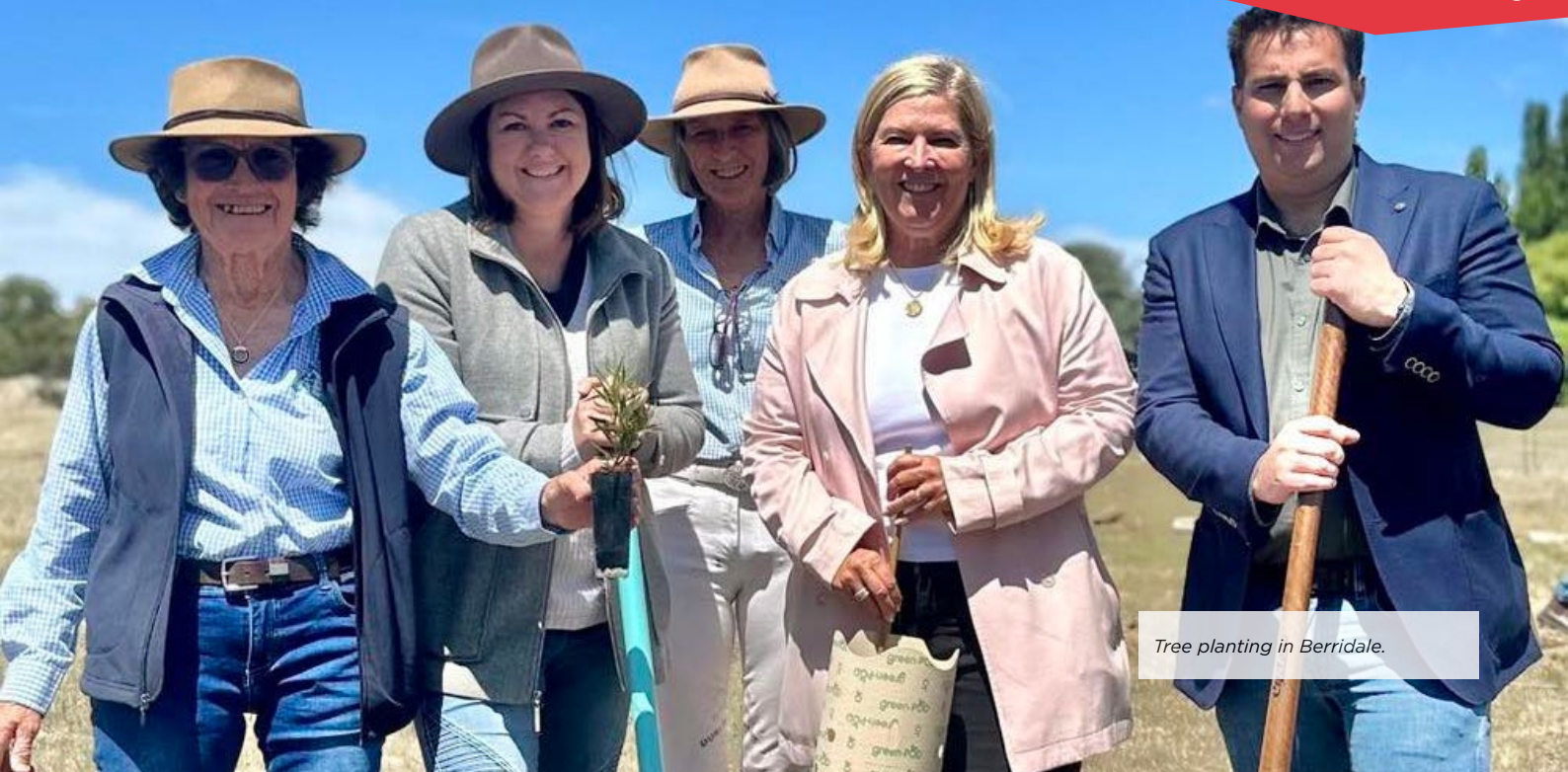
Tree planting in Berridale.