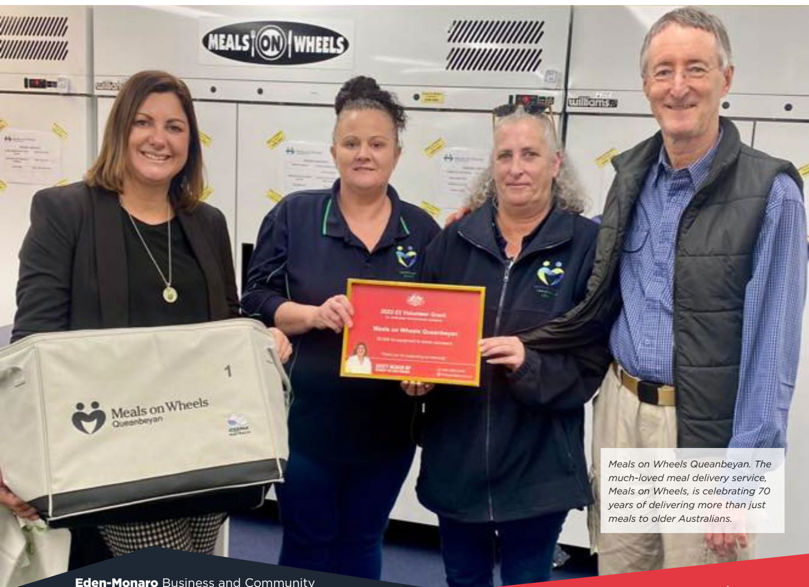
Meals on Wheels Queanbeyan. The much-loved meal delivery service, Meals on Wheels, is celebrating 70 years of delivering more than just meals to older Australians.

① https://lionssavesightfoundation.org.au/grant-information