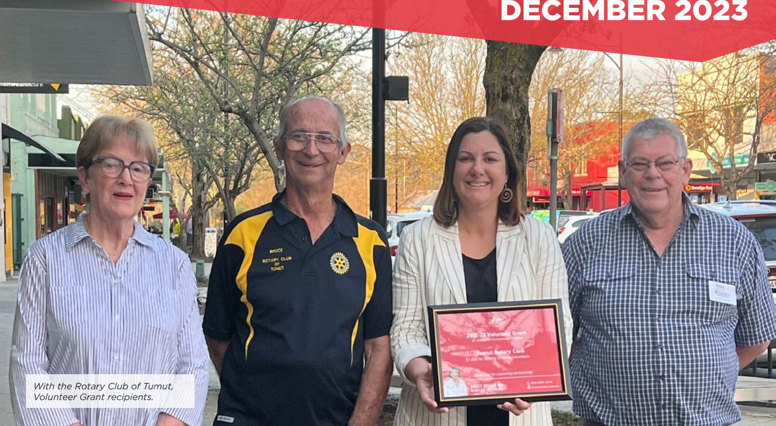
With the Rotary Club of Tumut, Volunteer Grant recipients.