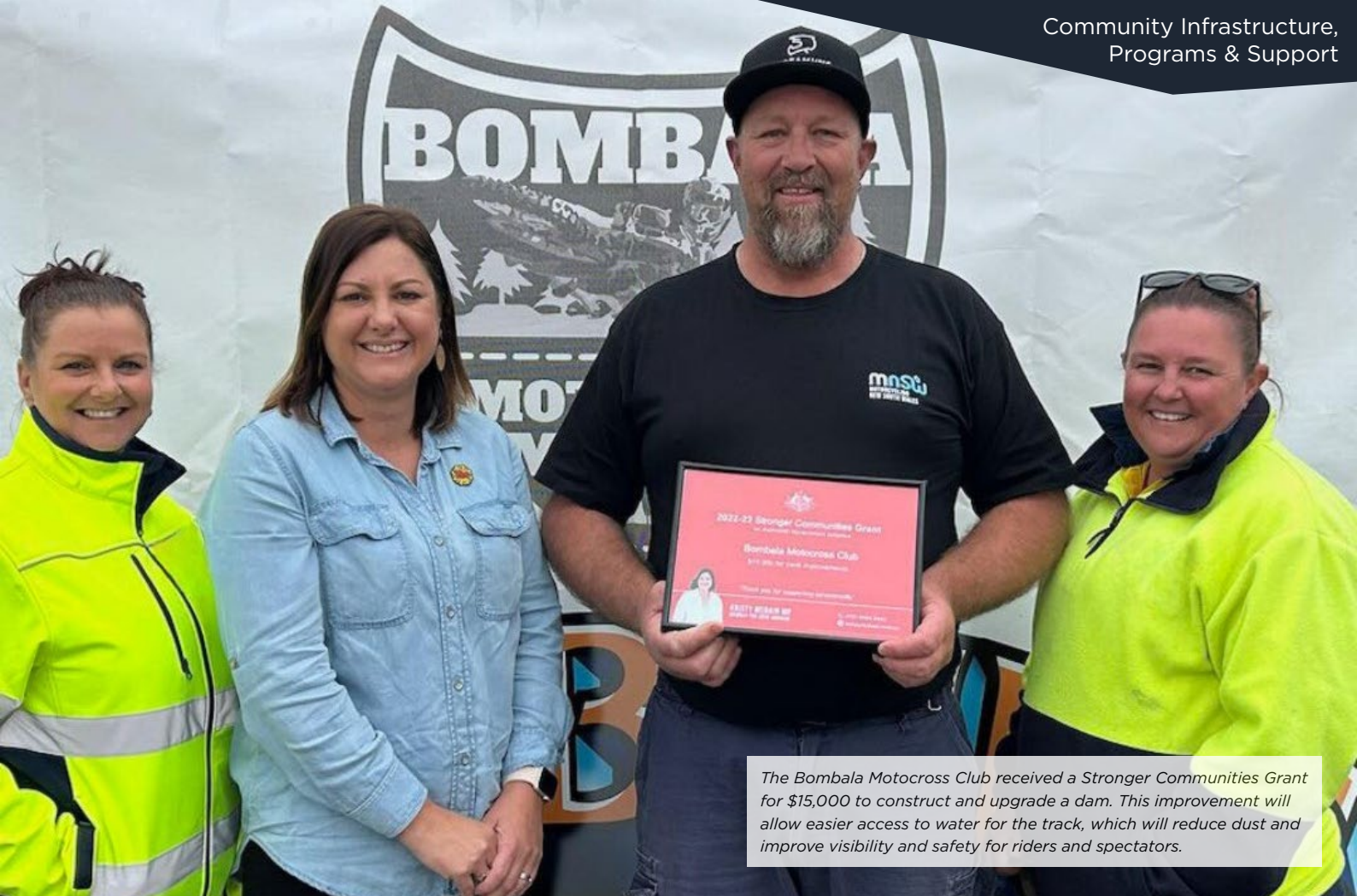
The Bombala Motocross Club received a Stronger Communities Grant for $15,000 to construct and upgrade a dam. This improvement will allow easier access to water for the track, which will reduce dust and improve visibility and safety for riders and spectators.