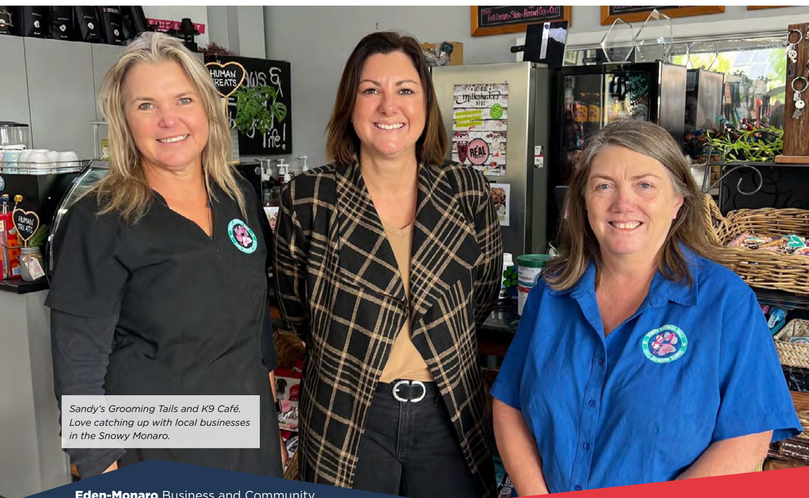
Sandy's Grooming Tails and K9 Café. Love catching up with local businesses in the Snowy Monaro.

① https://business.gov.au/grants-and-programs/industry-growth-program#apply-now