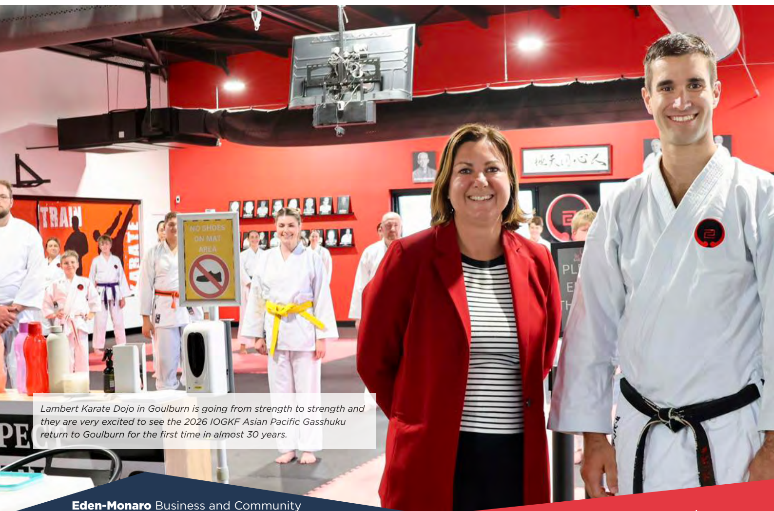
Lambert Karate Dojo in Goulburn is going from strength to strength and they are very excited to see the 2026 IOGKF Asian Pacific Gasshuku return to Goulburn for the first time in almost 30 years.

① https://horizonbank.com.au/blog/blog-article/community-grants-program/