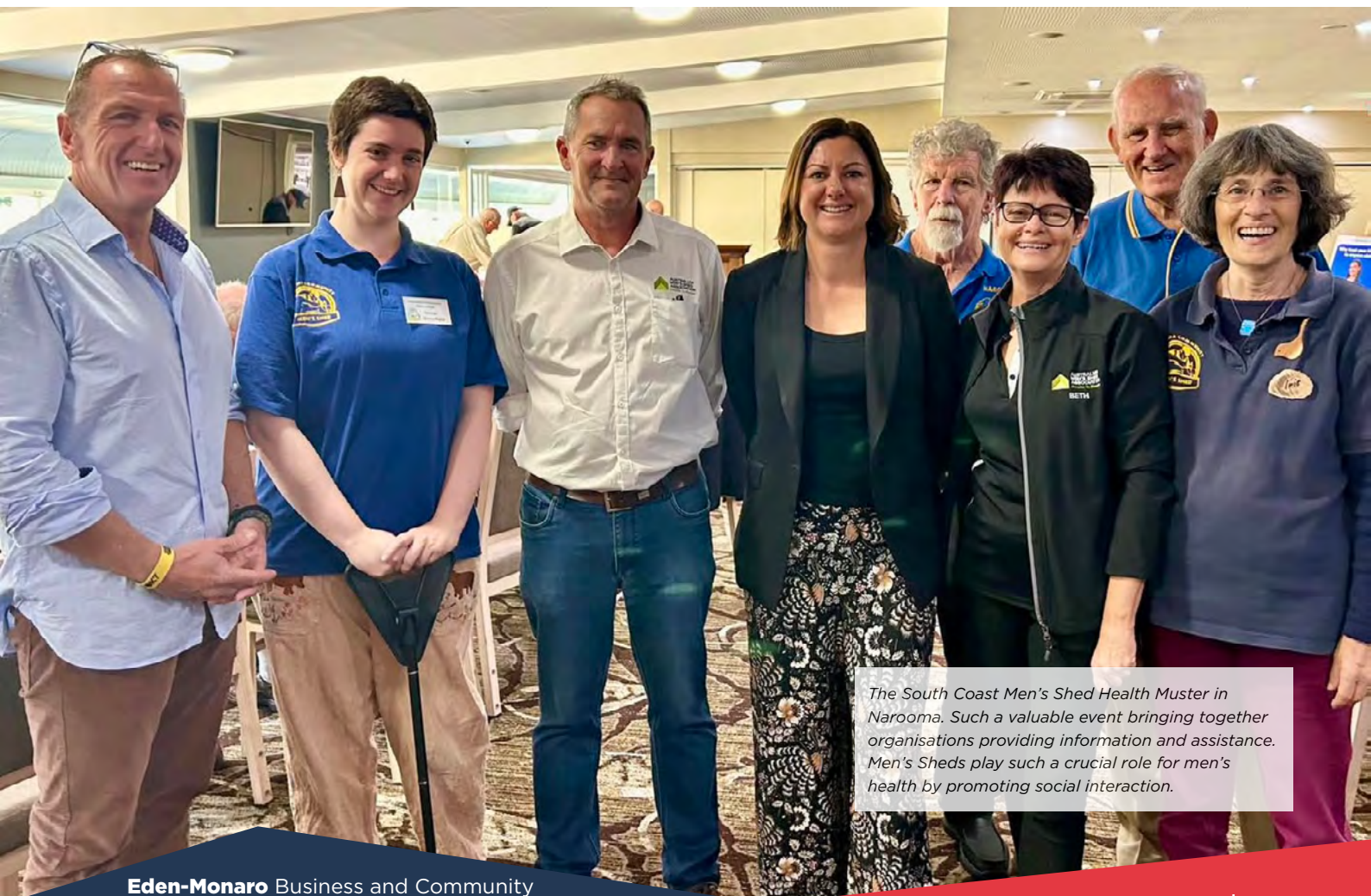
The South Coast Men's Shed Health Muster in Narooma. Such a valuable event bringing together organisations providing information and assistance. Men's Sheds play such a crucial role for men's health by promoting social interaction.

① www.gambleaware.nsw.gov.au/resources-and-education/funding-to-prevent-gambling-harm/community-benefit-payment-program